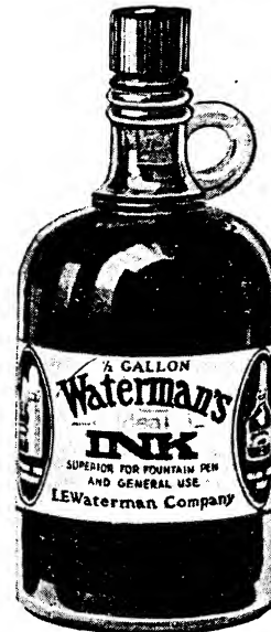
Half Gallon with Pour-Out. Packed Individually. Shipping Weight 10 lbs.